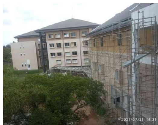
Three Storied lecture hall building for Faculty of Technology ,Ruhuna Uni.. Estimated Cost Rs. 412 million