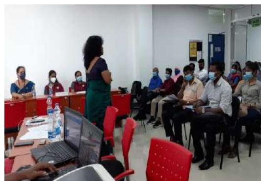
Conducting registrations for the 5 th intake at Non-State Higher Education Institutes