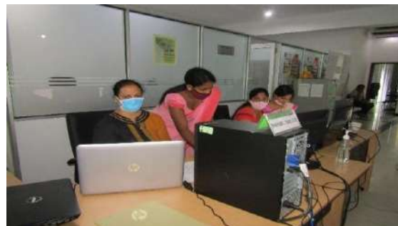
Conducting online interviews for the selection of 5 th intake