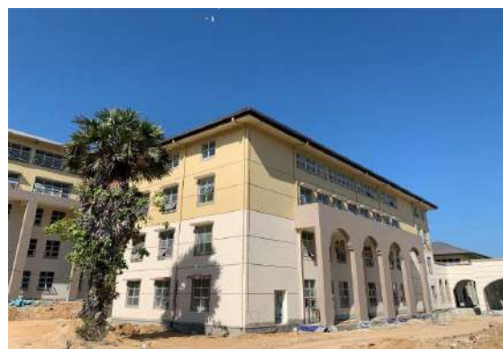
Department of Primary Health Care and Department of Medical Education