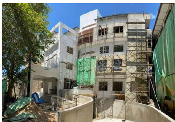
Department of Computer Science Building, University of Jaffna -Estimated Cost Rs. 240 million

Figures of the Construction Projects implemented under the AHEAD Project